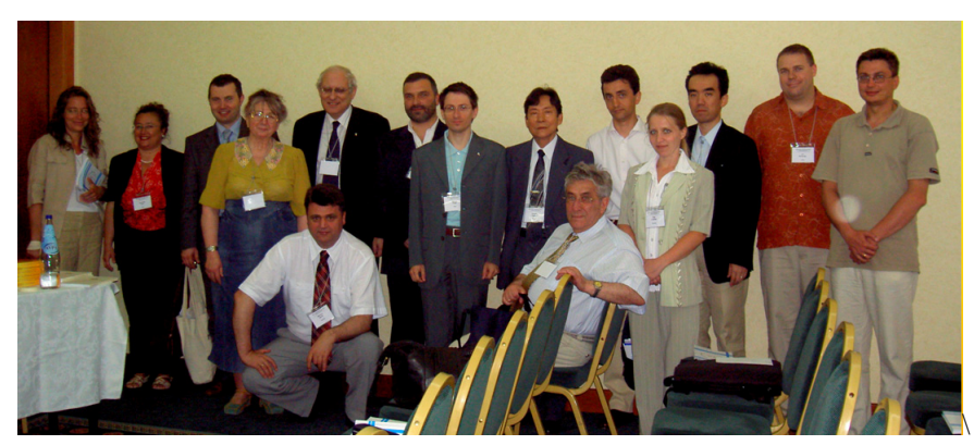
Participants of the Minisymposium Integrity of Dynamical Systems at The 16th European Conference on Fracture 2006